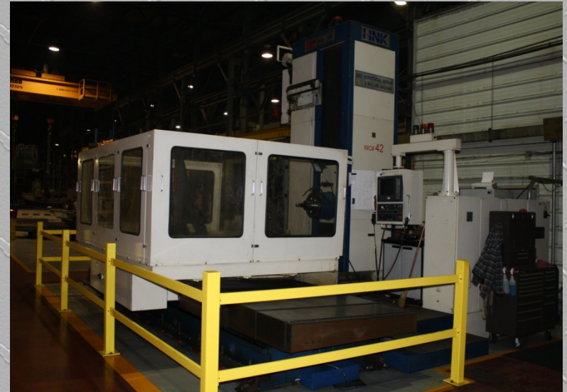
HNK CNC Model HB-150