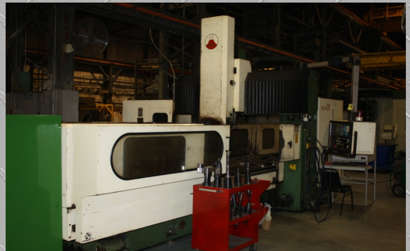
Kao Ming CNC Model KMC-3000SD